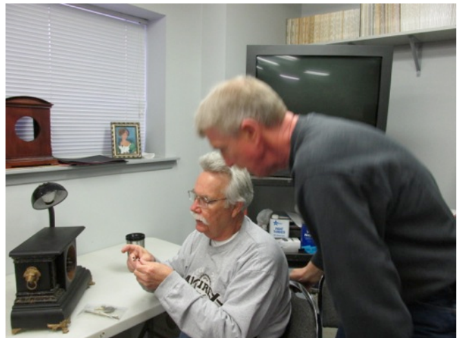
Troubleshooting a black mantle clock