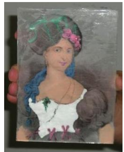
Front before background is painted