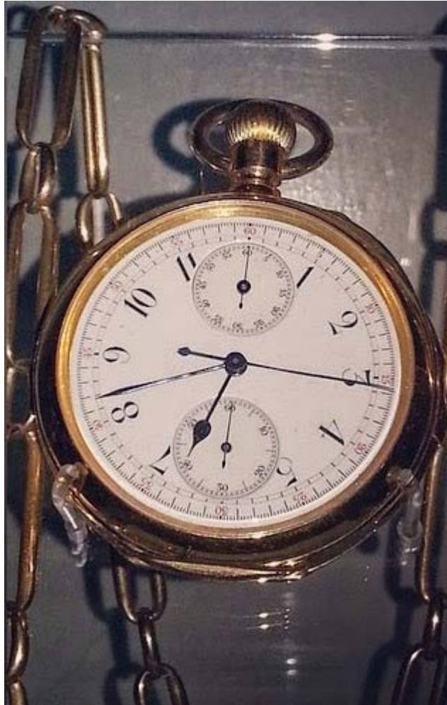
Breguet N° 765, minute-repeating split-seconds chronograph